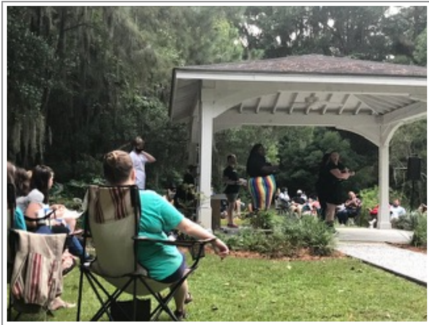
Moon River Opera company