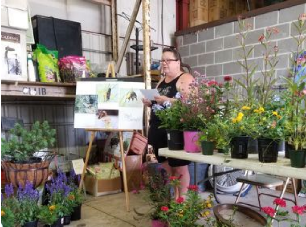
Went to Secret Gardens.