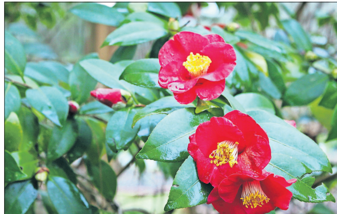
Foggy dewdrops bead up on the petals of the Ann Reinhard camellia.

It is what is called a "chance seedling," a plant that has come from a natural pollination, a seed formed by serendipity. On some past warm winter day, the right encounter of a bee carrying pollen from the anther of one flower to