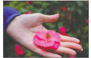
A Crimson Candles camellia blossom is as light as a ballerina's tutu.

We visited the Tama-no-ura variety, a red-and-white single, similar to the